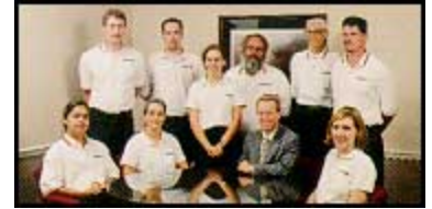
Our Engineering Team

barriers of conventional design and rapidly redefining our industry along the way.