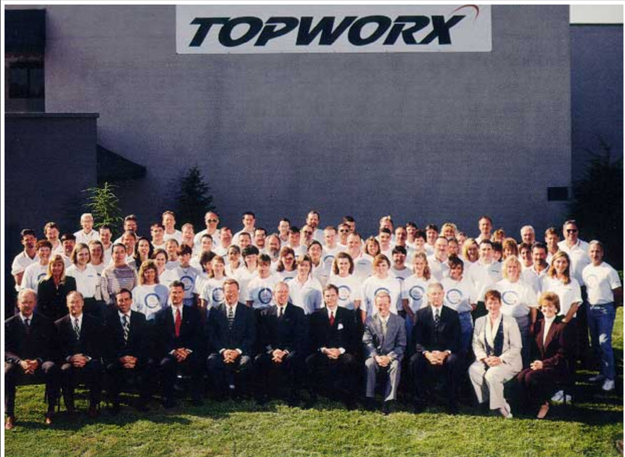
The TopWorx Family!

Thank you for helping us get where we are today. We look forward to reaching new heights in the future.... together.