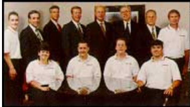
Our Sales & Service Team

"Take away my people but leave my factories and soon grass will grow on the factory floor. Take away my factories but leave my people and soon we will have a new and better factory." - Andrew Carnegie